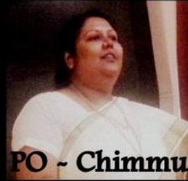
PO - Chimmu