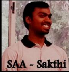
SAA - Sakthi