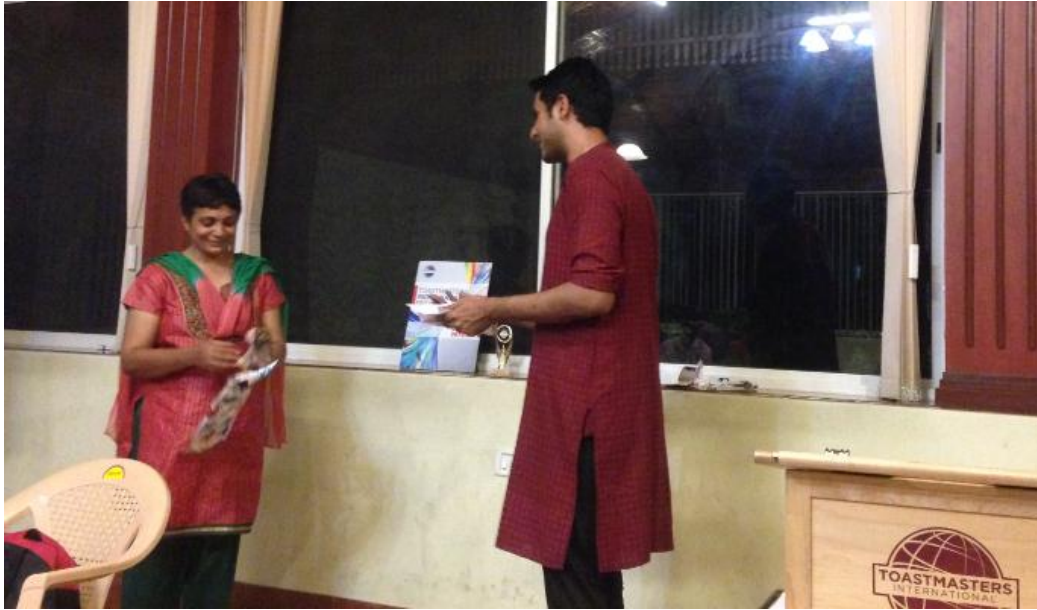
A new custom of taking feedback from a guest at the end of the meeting