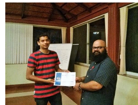
Best TT Speaker