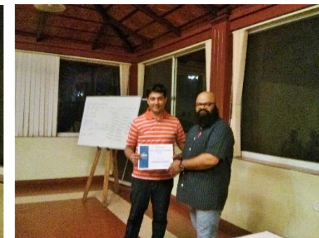
Most Improved Speaker