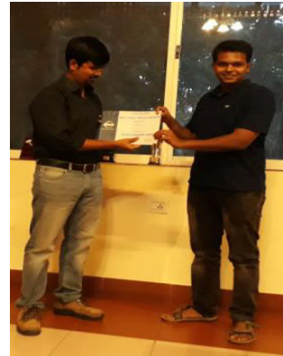
Best TT Speaker