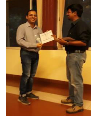
Most Improved Speaker