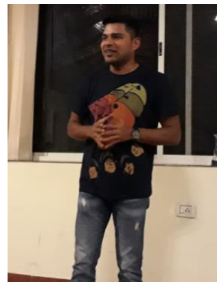
TTM- TM Shobit